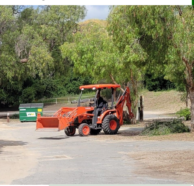
Orlando Martinez during Oak Park Work Day

changes to the transportation and supervision of work crews at their designated work location. Through this pilot program, Probation has provided a dedicated work crew weekly to the Parks Department and the availability of future work crews will increase through the program. To ensure success for all parties, County Parks created dedicated parking and check-in signs and established a protocol for scheduling work crews through the utilization of calendar invites along with the inclusion of